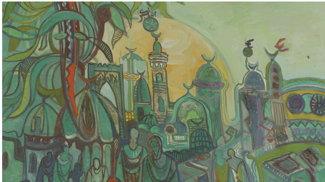
Figure 10. Abdulhalim Radwi, 1995, AlMadina Al Monawara , Oil on canvas, 100 x 80.5 cm.

Ali (1992) asserts that other artists made calligraphic paintings but also incorporated the local culture by mixing geometric and floral arabesque motifs, Islamic architectural shapes of domes, along with Arabic letters and words. This kind of mixture is found in the work of many Arabian artists who combine local crafts motifs with calligraphy for the sole purpose of bestowing an Arab and Islamic identity on their work. Many contemporary artists today have also adopted the method of using Western techniques to communicate Arab concepts and experiences.