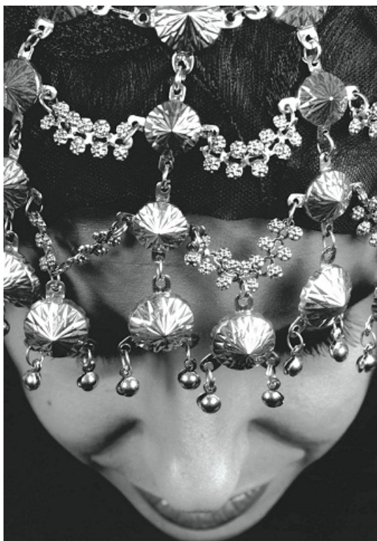
Figure 4. Manal Al Dowayan, Gold Chains , 2009. Silver gelatin fibre print, 51 x 41 cm.

Through K-12 schools and colleges, the Ministry aims to create an educational system that builds a globally competitive knowledge-based Community. The gender-segregation within educational institutions becomes more prominent at the college level; not only are males and females segregated physically, but there is a separation in what the Ministry of Education deems appropriate for males and females to pursue educationally, and eventually, professionally. In reality, the numbers of institutions that cater to women's art education clearly outnumber the men's, which also explains the large number of emerging female artists in the country.