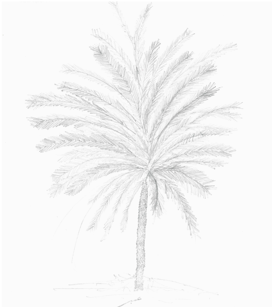
Figure 25. A pencil sketch of a palm tree by an 11 th grade student during brainstorming ideas for the mural, 2017.

Students are sensing that traditional arts are influencing the content of their art making, and inhibiting them from communicating ideas that may not necessarily be “beautiful” by conventional standards. The student, M.M., explained, “Art and art making are about finding ways to show beauty through colors, lines, and shapes.” She added, “I am not sure if I want to become an artist, but I wouldn’t mind. If I do choose to study art, I will study in a foreign country where they teach you everything about art