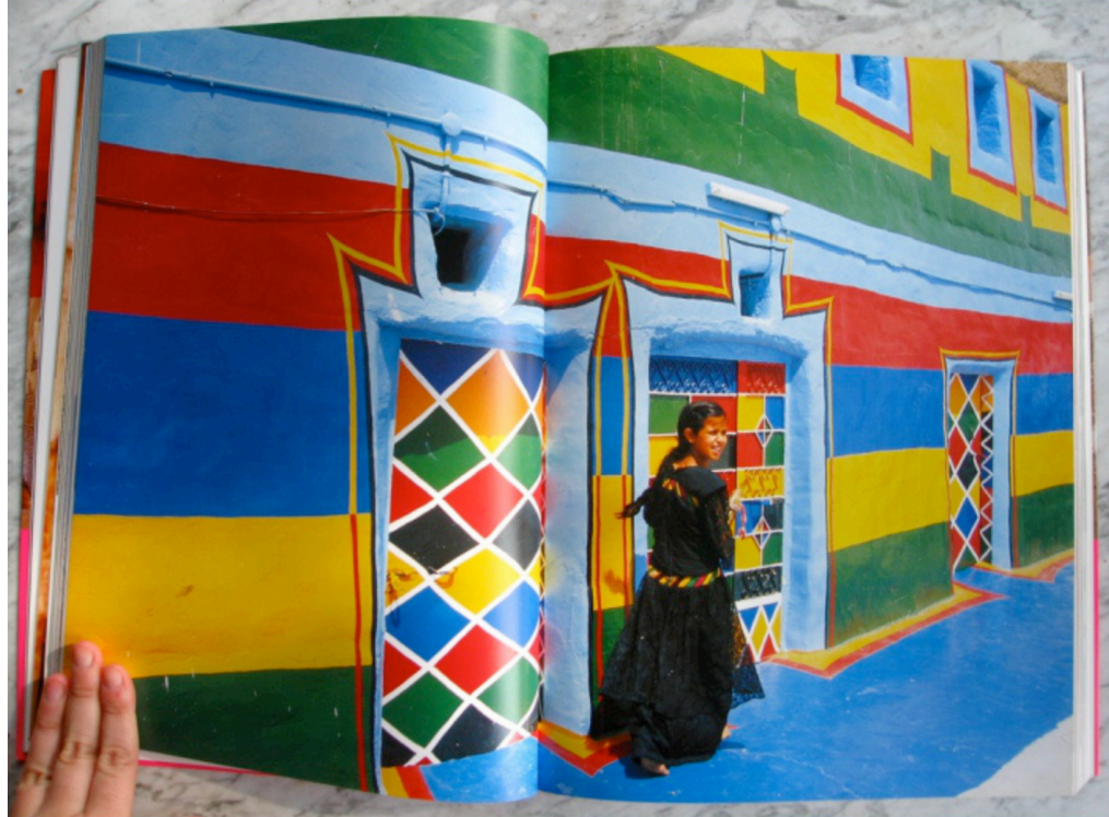
Figure 13. Exterior traditional painting of a traditional house in Saudi Arabia, Colors of Arabia: The Painter's Garden.

Shabout (2010) explains that since the mid 20 th century, Arabs have been striving to achieve a form of self-expression that connects to their realities. The obstacles concerning tradition and modernity, past and present, is a result of the abrupt arrival of a superimposed modernization. Arabs had to absorb several hundred years of Western progress in a few decades (Gibb & Bowen, 1950). Boullata (1997) has also explained that whenever the application of modernity intensified, the return to tradition would also increase. This back and forth movement between the old and the new has become a defining characteristic of Arab cultures. The issue is identifying a unifying principle or characteristic in modern Arab art, similar to that of Islamic art, is that such a quest ignores the nature of modern and contemporary art.