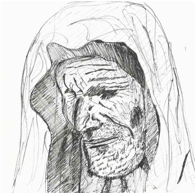
Figure 27. Pen drawing by a senior college student, 2017.

The drawing classes followed a similar structure. The educator walked in, greeted the students, and asked them to pin up all the drawings they had made since their last session. The lessons focused on self-portraits, and students were drawing themselves any way they chose to. They were continuously working in class, and it seemed, as there was a cycle of thinking, making, and then discussing. They were curious about how their classmates were drawing themselves. One student talked about how “drawing yourself is something challenging because it is so personal.” While observing two photography classes, and two drawing classes, what is noticeable is that the art educators were flexible in their teaching approaches. Each class had 12 students, and the educators gave all the students opportunities to share their ideas, thoughts, and to offer their own individual suggestions to their professor about lessons they wish to have in the future.