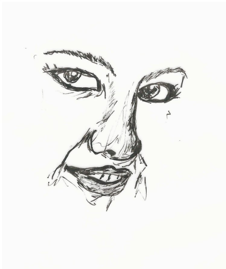
Figure 34. Pen drawing by a junior college student, 2017

The best art programs in the world are not necessarily programs that are the oldest, but programs that introduce a variety of teaching methods and opportunities for students to make art individually and collectively within their schools and colleges, and in their free time. Much development is needed in terms of teaching students to be independent thinkers and makers, and hopefully we will find a way despite the limitations of society and culture.