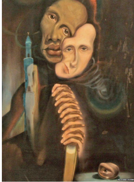
Figure 9. Dia Aziz Dia, 1969, Untitled , Oil on canvas, 122x90 cm.

Pioneers of modern Saudi art. According to Ali (1997), until the late 1950s and early 1960s, there were no trained modern artists in Saudi Arabia. She also mentioned that the first of the early Saudi artists to be sent abroad was Abdul Halim Radwi (1939-2006), who trained at the Accademia di Belle Arte in Rome and later obtained his Ph.D. in art history from Spain. He was a painter and sculptor who emphasized the significance of drawing from one's own cultural heritage in a modern interpretation. Another early pioneer painter mentioned in Ali's (1997) research is Mohammed Mosa Al-Saleem (b.1939), who began painting and teaching art in the late 1950s without any previous formal art training. Aside from a few fragmented calligraphic paintings, his works mainly depict desert landscapes. The artist Dia Aziz Dia, one of the also one of Saudi Arabia's early pioneers who was sent to Rome on a government-funded scholarship to study art in the 1960s, was inspired by surrealism, which made its way into his paintings (Figure 9). Safeya Binzagr (b.1940), a female pioneer in Saudi modern art, was the first Saudi female to hold a solo exhibition of her work.