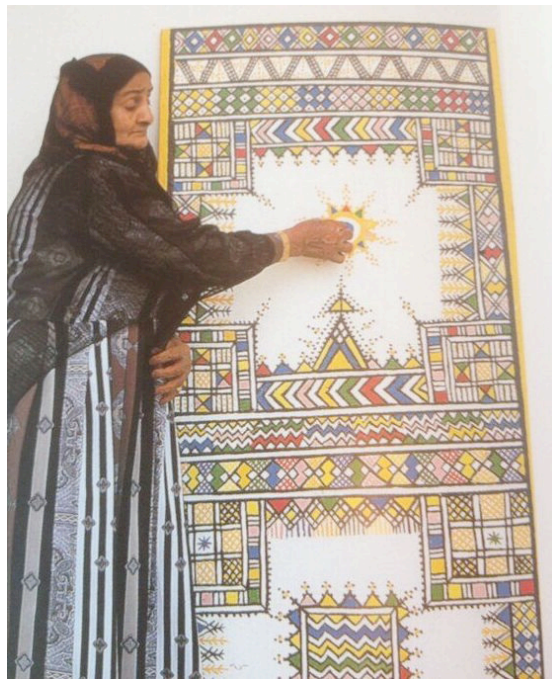
Figure 3. A female traditional Saudi patterns painter from Asir Province painting a door.

at an art institute, and some had no training whatsoever. Today, art teachers are required to have a Bachelor's degree to teach in high schools. In colleges, art educators are required to hold a Bachelor's degree, and preferably a Master's degree in some form of visual art (A. Eissa, personal communication, February 13, 2017). These changes in the educational system are beneficial on the surface; however, there is only one university in Saudi Arabia that actually offers Master's and Doctoral degrees in art and art education, which limits the possibilities of earning such a degree locally. Consequently, the different educational experiences and working environments of high school and college art educators may influence the ways in which they teach art to their students, and the ways in which they perceive art themselves. Also, if there are no breadth classes in colleges that expose students to a range of art, artists, art criticism, or art theory; what are art students learning about art?