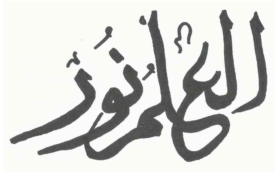
Figure 19. Another example of an 11 th grade student's Arabic calligraphy “knowledge is light”, 2017

These perceptions can go a long way in influencing upcoming generations' knowledge about art. The student S.J. explained she can recognize traditional art if she saw it outside of school, but is “unsure what contemporary art would look like.”