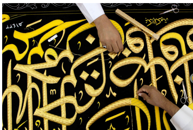
Figure 1. An example the use of Islamic Art (calligraphy), which is also considered a traditional art form: The kiswa (fabric that covers the Ka'bah in Makkah) being sewn with holy excerpts from the Qur'an with the use of silver threads covered in gold.

UAE, I learned about Western art and art making techniques, from Western professors, but I did not learn anything about Arab art or artists. There were no Arab art educators in my program, and no art educators from other parts of the world who had an interest in teaching art from the Arab region. From my perspective, within educational institutions, there seemed to be no sign of modern or contemporary Arab art. 1 It has become apparent to me that there is a disjuncture between Arab societies and newer forms of Arab art inside and outside of educational institutions.