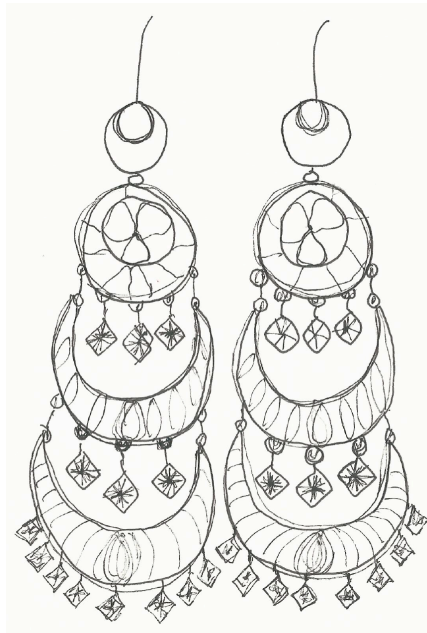
Figure 24. A pen drawing of traditional earrings by an 11 th grade student as part of the mural, 2017.

their teacher for guidance and inquired about how to paint certain details and fit everything proportionately on the panels since they were not used to making art in such a large scale. The teacher gave the students plenty of attention and answered all the questions patiently and to the best of her ability. They stopped painting the murals once in a while and each group would look at the progress their classmates were making on other panels. The students briefly discussed how their murals were coming along and what meaning they attributed to the art in progress.