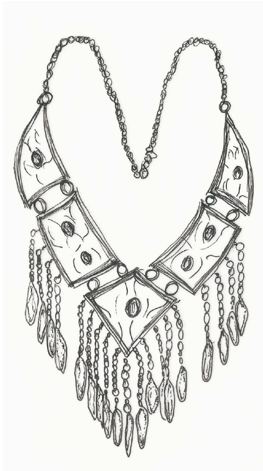
Figure 22. Pen drawing of a traditional necklace by an 11 th grade student as part of the mural, 2017.

shortcomings as well as advantages. Saudi Arabia has neglected art not by eliminating it all together, but by failing to see its potential as a tool that could be aesthetic and educational.”