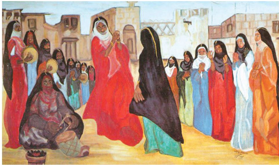
Figure 2. An example of Saudi modern art by pioneer female artist Safeya Binzagr, 1975, A Scene of Dancing Saudi Women in Their Traditional Dresses , 100 x 70 cm.

Traditional art is also seen as a form of Islamic art, since its distinctive characteristics are originally heavily based on calligraphy in fear of depicting the human form as being idolatry. In more contemporary times, it also includes the depiction of landscapes, Arabian scenery, jewelery, and it continues to shy away from figurative portrayals (Ali, 1997).