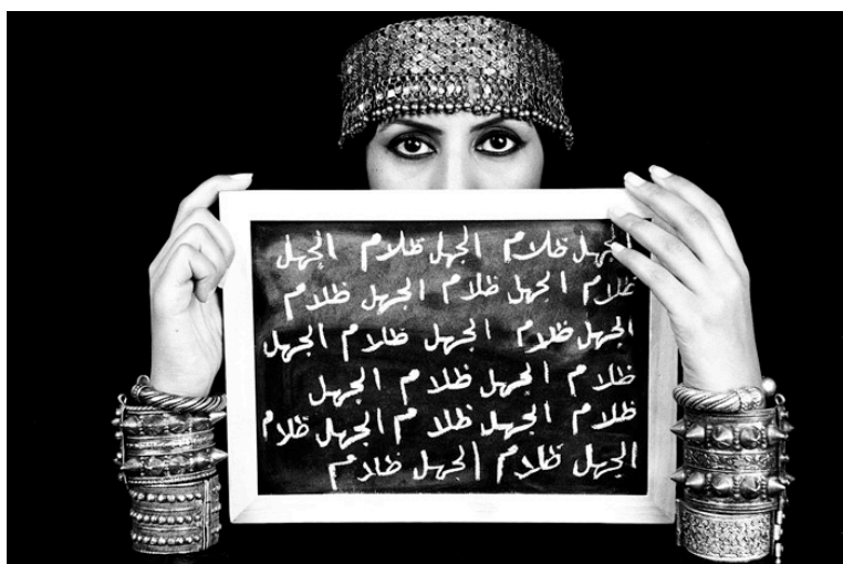
Figure 5. Manal Al Dowayan, 2006, I am an Educator , silver gelatin fiber print, 41x51cm

This issue also sheds light on the large number of self-taught male artists in both traditional and contemporary arts. Additionally, the lack of available institutions for men has led many artists to undergo their education abroad, mostly in the West, which may influence their art making and the way it is received by Saudi Arabian audiences when they return home. Females also pursue art education abroad but for different reasons, such as pursuing a graduate degree in a particular form of visual art that may not be offered in Saudi Arabia (L. Harbi, personal communication, October 3, 2015).