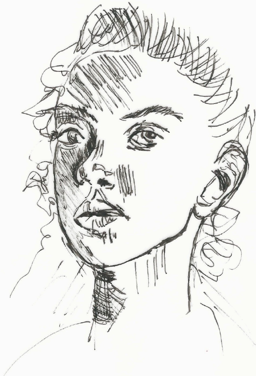
Figure 35. Pen drawing by a senior college student, 2017