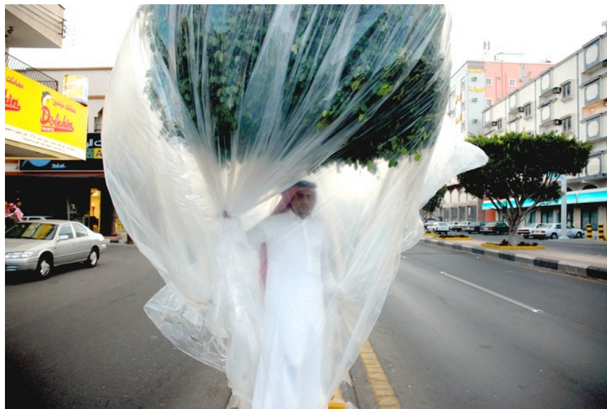
Figure 6. Abdunnasser Gharem, 2007, Portrait of the Artist from the performance Flora and Fauna , digital print, 60cm x 85cm.

women to travel in pursuit of education because it was not deemed culturally appropriate. Traditional artists have been on the art scene longer, and are more focused on Arabic calligraphy and landscapes (S. Mazen, personal communication, August 4, 2015). In contemporary times many of the aspiring traditional and contemporary male artists continue to seek art education abroad or are self-taught, while the female aspiring artists have more opportunities to attend art colleges in the country.