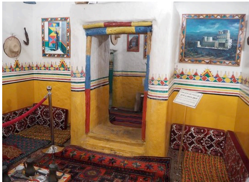
Figure 12. Interior decor of a traditional house in Saudi Arabia, which contains traditional art, Al-Tayebat Musuem, Jeddah, Saudi Arabia.