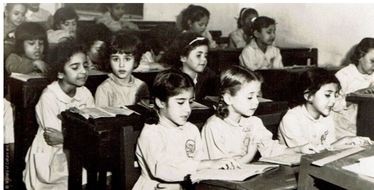
Figure 14. Students in Dar al-Hanan School in Jeddah, Ministry of Culture and Media.

Arab countries that had already established their own modern educational systems, such as Kuwait. The members of the newly established Ministry worked to evaluate existing educational institutions, and to establish new schools and colleges. The Directorate also focused on the development of students, which led to the formation of the first council of education to develop the quality of education and the curriculum in Saudi Arabia. This period of education chiefly focused on religion, and other subjects were kept on the periphery, and art education was not a part of the curriculum (A short History of the Ministry of Education, 2015). It is important to note that the first schools established in Saudi Arabia were for males, and it was not until 1955 that the first school for females opened; in 1960, the first Ministry of Education was established for women, separately from the male's Ministry, and was called the Presidency of Education (The Ministry of Education Report, 1961). In other words, art education was solely offered to male students in the past, but soon after was seen as a field more suitable for women in Saudi Arabia.