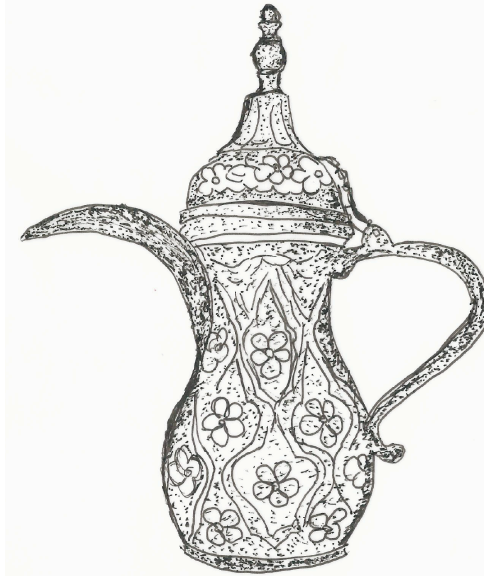
Figure 15. An 11 th grade student's pen drawing of a traditional Arabian coffee pot, 2017.