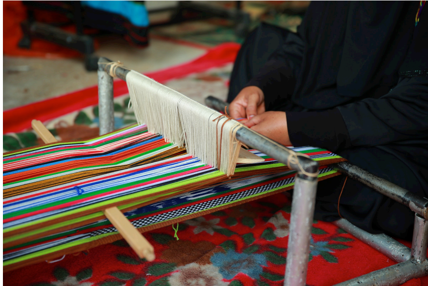
Figure 8. A woman weaving a carpet at Al-Janadriyah Cultural Festival, 2016.

Arabia and the rest of the world weakened as trade routes changed. Only the Hijaz (the Western Province of Saudi Arabia today), where Mecca and Medina have obtained a special religious status since the rise of Islam, maintained ties with the rest of the Western world. When empires of Islam rose and fell, their cultural achievements barely influenced the peninsula. Nevertheless, Ottoman influences were present in the Mosque of the Prophet in Medina and the Haram Mosque in Mecca. The Ottoman government restored and enlarged these sites because of their religious significance.