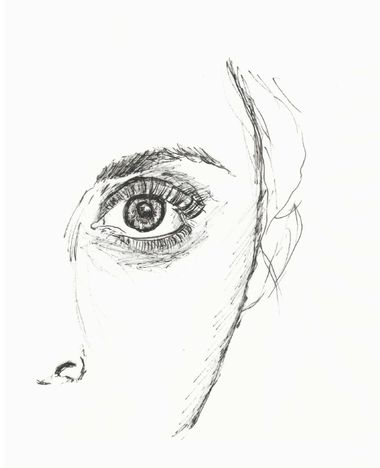
Figure 31. Pen drawing by a sophomore college student, 2017