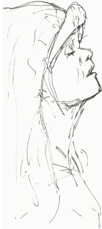
Figure 32. Pen drawing by a sophomore college student, 2017

grasp by social experience. My art education abroad showed me that certain art movements begin because of certain social, religious, or even cultural circumstances; photography is not an art movement per se, but in Saudi Arabia it is definitely a drastic change in approaches to art making because photography was not considered an art form in the past. In fact, many people still don't consider it art. The media that is being used in colleges especially has definitely evolved to meet the same tools that are being used by practicing artists, but what is vastly different is the content. In the public sphere, there is more flexibility with content.