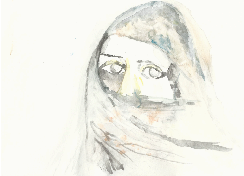
Figure 29. Watercolor by a junior college student, 2017.

as art.” She raised the point that contemporary art is even compared to the arrival of satellite television in Saudi Arabia, “It is mostly out of fear that contemporary Arab art will influence Saudi Arabian culture negatively; it is a similar reaction to when Internet or satellite television were introduced, and religious and conservative people were completely against it and tried to ban it.”