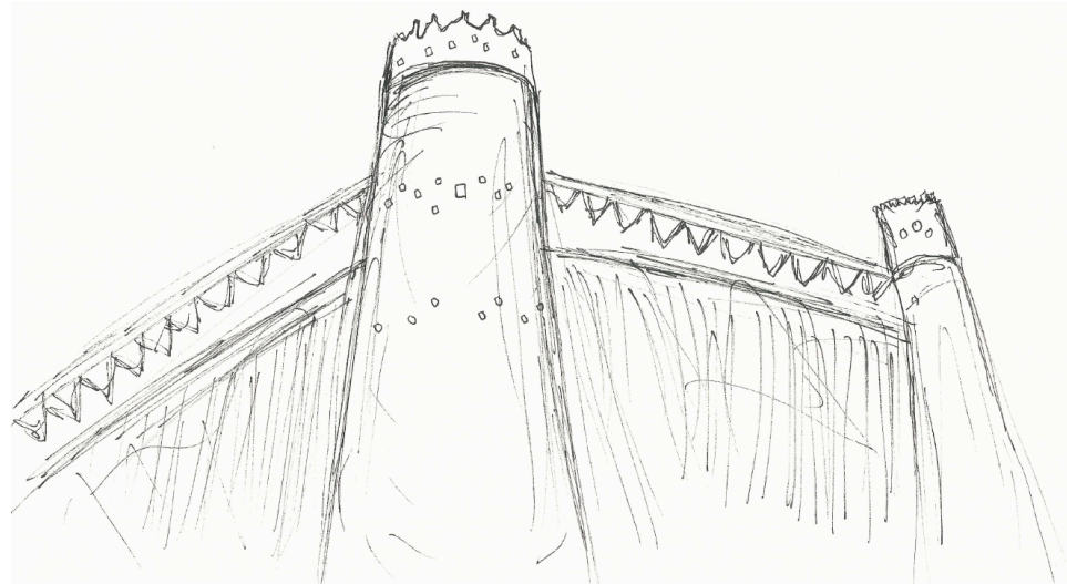
Figure 21. Pen drawing of a traditional Arabian fort by an 11 th grade student, 2017.

flourished under circumstances where it is not restricted, and that is our biggest obstacle to overcome.