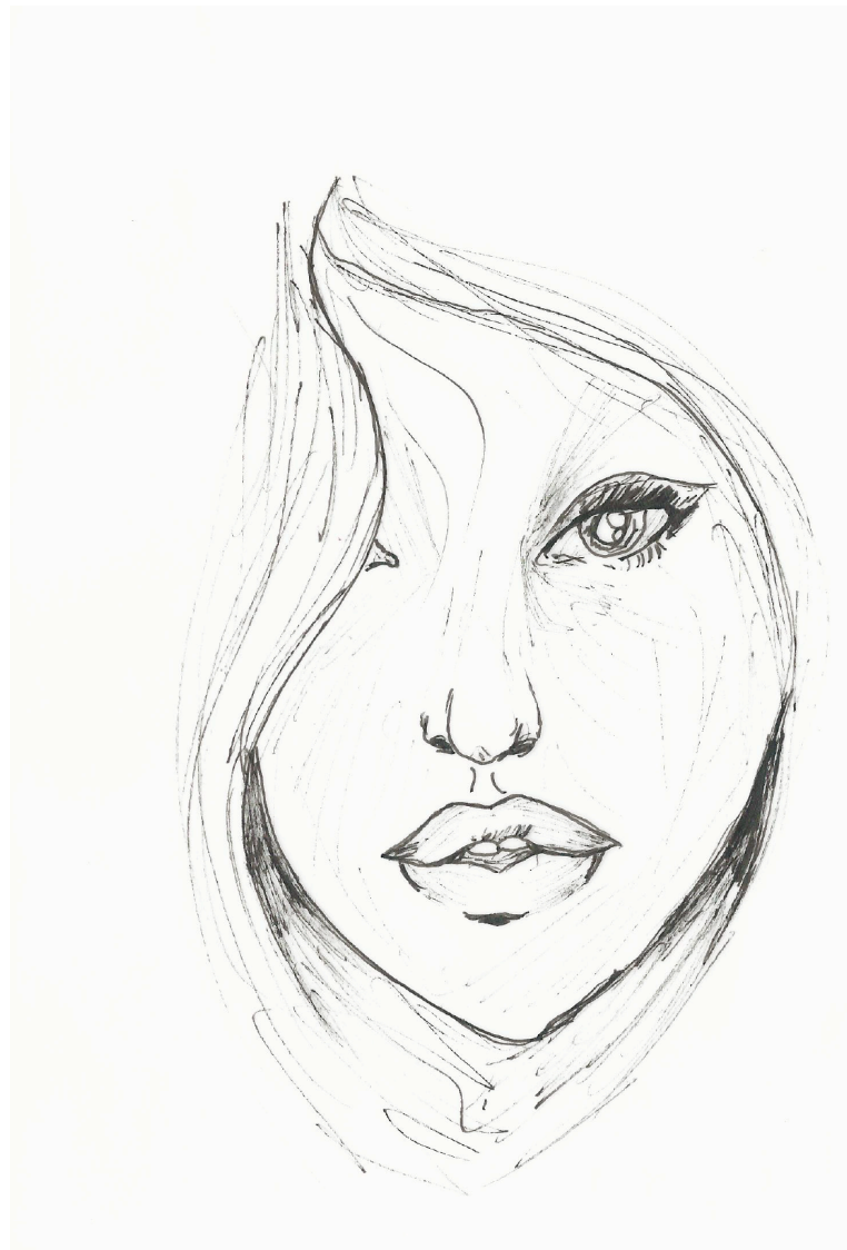
Figure 30. Pen drawing by a sophomore college student, 2017

however, art education is taught almost the same way throughout a student's education. They make art about the same topics or ideas, and they execute the artwork using the same media they used the year before. That is because art education is given less importance when other subjects take center stage. At the college level, students are pursuing art as their main subject, and so the criteria shift according to the need. Students have a variety of classes, professors, and make art in a variety of ways.