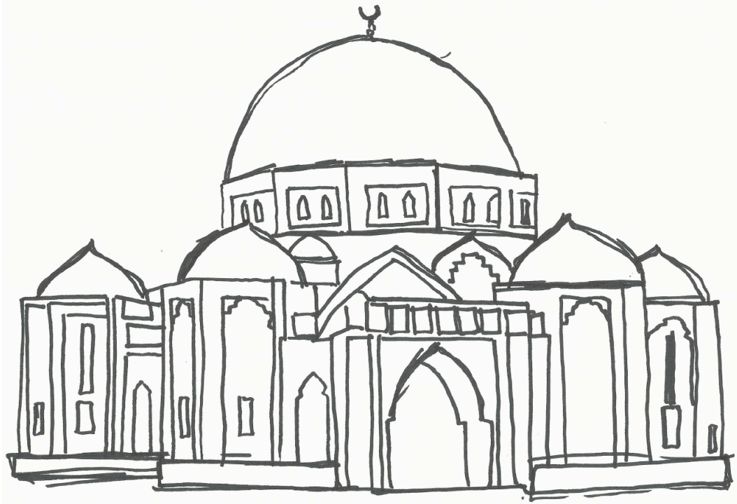
Figure 23. A pen drawing of a mosque by an 11 th grade student, 2017.

streaming into the space, but grew quieter as they took their seats. They all directed their gaze towards the art educator who was standing in front of her desk patiently waiting for the students to get settled in before she began talking. She greeted the students and informed them that they would be working on a group project as a class. The 25 students would be painting a mural in the schoolyard. It was not the first time the class worked as a group, but would be the first time they made art on a surface other than paper. The students seemed to be rather excited with this new project. One student quickly asked, “What’s the mural about?” Another said, “How big will it be?” The art educator responded, “It would be about three themes combined together, and the scale would be discussed by the class as a group.”