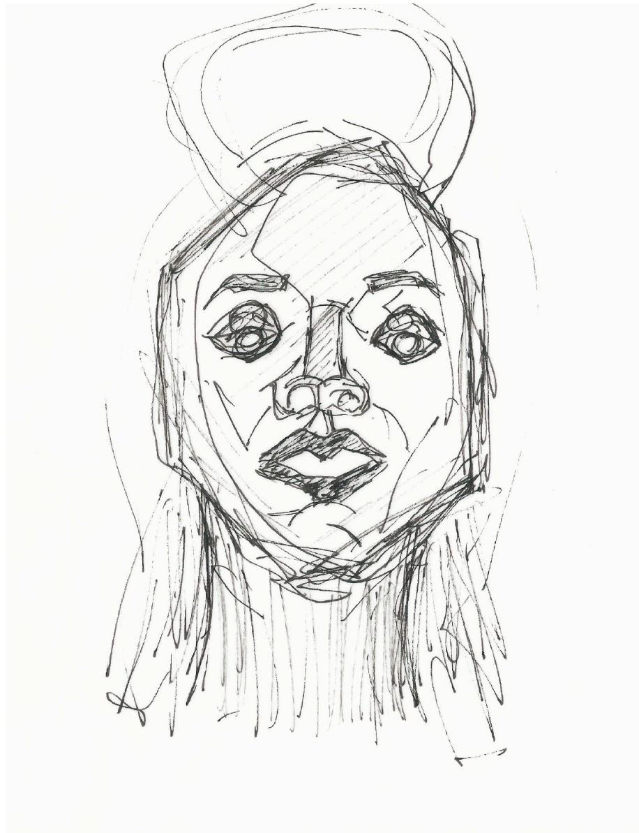
Figure 33. Sketch by a senior college student during class, 2017

using photography excites me very much because I did not get to make art using photography when I was in school.” She also emphasized that the biggest difference between high school art and college art is “the sense of artistic independence given to students at the college level.”