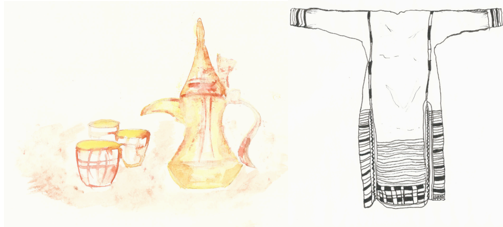
Figure 16. (Left) Watercolor illustration of a coffee pot and cups by an 11 th grade student, 2017.

know very much about art face obstacles because of the objections from the Ministry and administrators.”