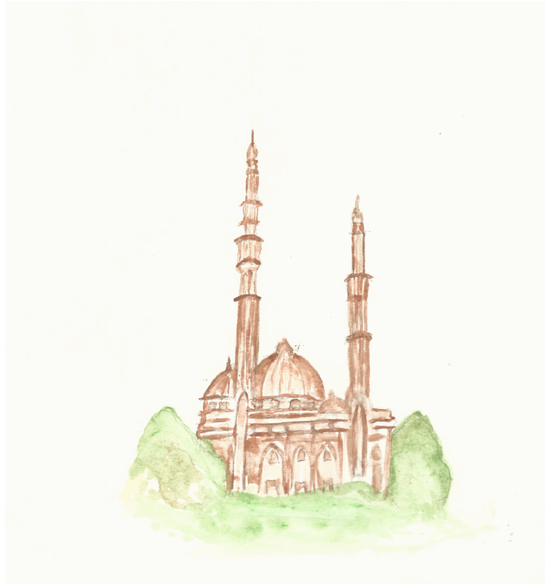
Figure 20. Watercolor painting of a mosque by an 11 th grade student, 2017.

would demonstrate on the students' drawings. A few of the students were very talkative with each other. They borrowed materials from one another, commented on each other's artwork, and occasionally had brief discussions with their teacher.